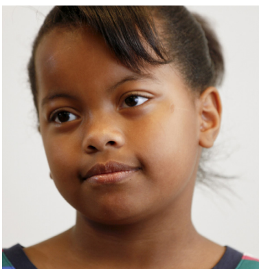
ACUTE LEUKEMIA TREATMENT